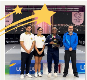
George Thomas Fair Play Award